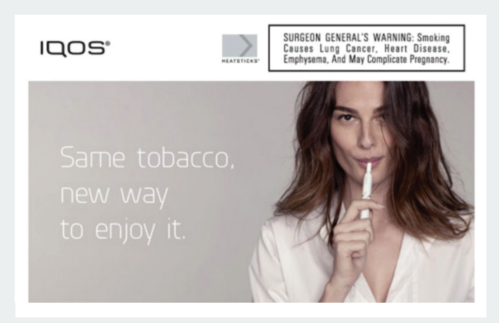
Source: Stanford Research Into the Impact of Tobacco Advertising (SRITA) (tobacco.stanford.edu)